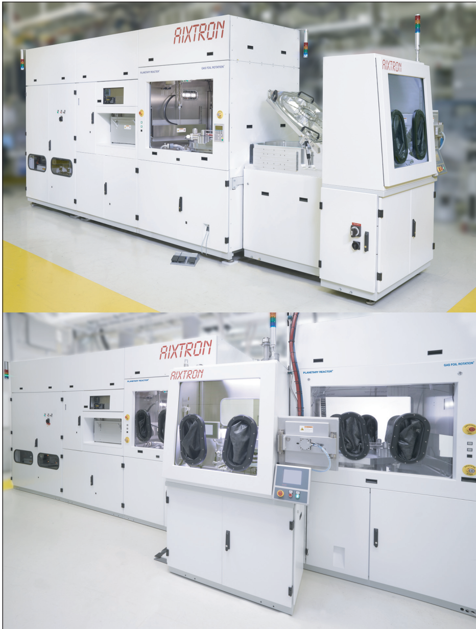
Figure 3. Single MOCVD module with automated transfer system (top) and MOCVD cluster tool with two process modules (bottom).