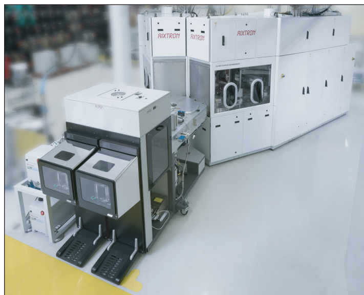
Figure 1. 300mm MOCVD cluster tool with two process modules for III-V on silicon processes.

As a manufacturer of both silicon-related CVD (chemical vapor deposition), ALD (atomic layer deposi-