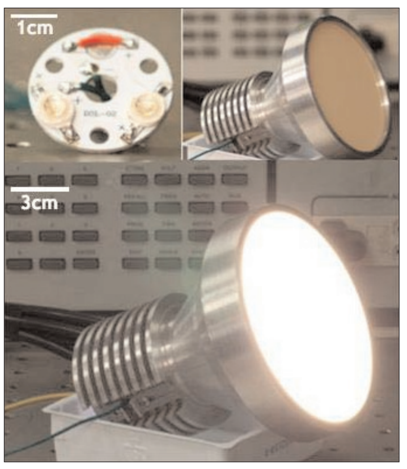
Schottky diode-based bridge rectifier monolithic circuit Figure 2. Packaged AC-LED devices mounted on circuit board and prototype AC-LED lamp with remote phosphor.

Single-chip AC-LED circuits were produced with lateral dimensions of 2.12mmx2mm. The monolithic circuit integrated 28 cascaded micro-LEDs and a bridge rectifier circuit of 8 SBDs. The bridge circuit used 2 SBDs in each branch to handle higher voltages. The SBD had 3 interdigitated Schottky contact fingers that were 20µm wide and spaced at 20µm intervals. The bridge circuit accounted for 11% of the device area. Putting 2 SBDs in each branch enabled rectifying voltages of up 240V, which should be sufficient to enable DC conversion of