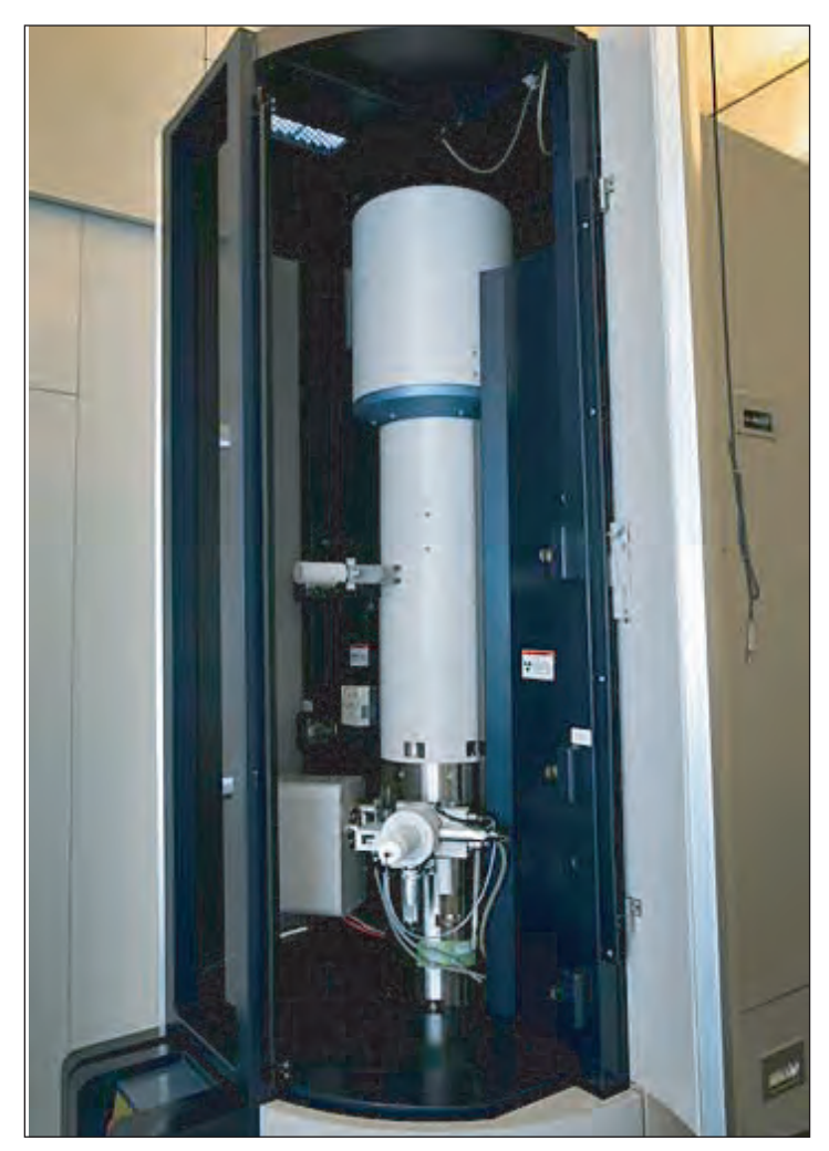
Non-destructive STEM imaging of specific InGaN samples demonstrates that indium-rich clustering does not drive the efficient light emission.

"The state-of-the-art instruments available at Brookhaven Lab's CFN changed the way we could test these promising materials," Gradecak says. "The CFN's aberration-corrected scanning transmission electron